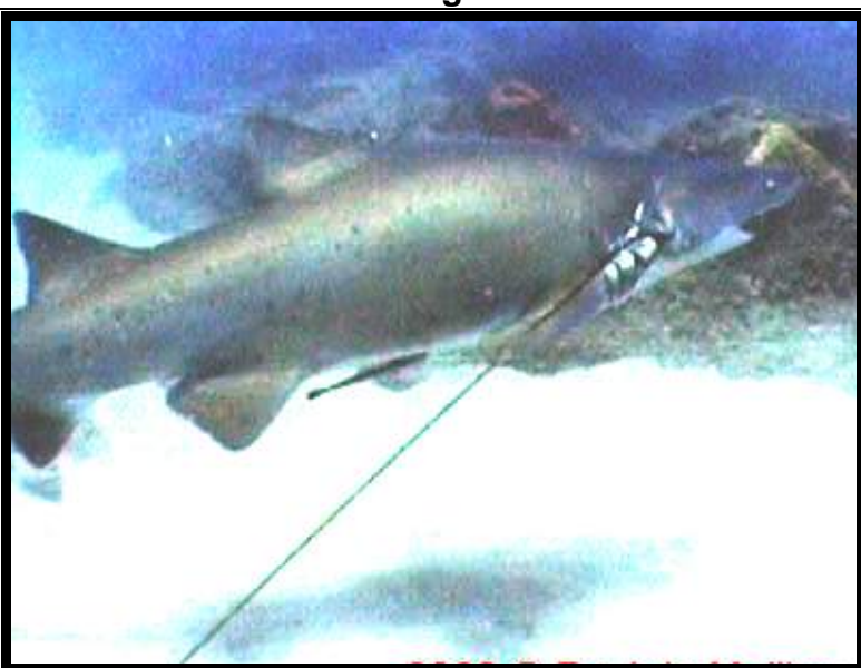
Shot in the Sodwana MPA

The KwaZulu Natal coast has been heavily over-fished and there is a very poor return for shore line-fishermen. A fishing return is possible at 40-fathoms but a boat is needed.